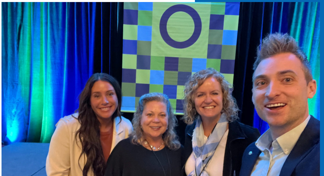
Workforce Boards at the Oregon Restaurant and Lodging Association Conference, 2024.

In Oregon, the Leisure and Hospitality industry comprises just over 10% of all employment. Statewide, the industry is the second largest business sector behind healthcare in terms of number of jobs. In 2022, the industry provided over 197,000 jobs to working Oregonians and brought in over $10.9 billion in annual sales for Oregon.