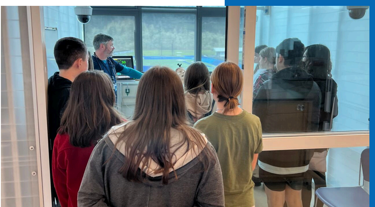
Connected Lane County Health Occupations Middle School Tour, April 2023.

In Lane County, healthcare is the largest of all industry sectors, in terms of total employment and payroll. In 2023, there were 21,782 people working in this critical sector, across 1,167 establishments. Average wages in this sector were $72,389 in 2023, making total payroll nearly $1.6B.