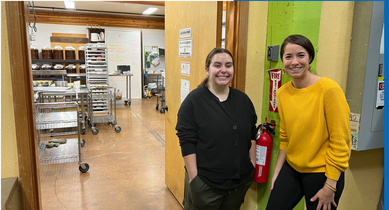
Positive Community Kitchen Tour, October 2022.

The food and beverage sector, a key traded industry in Lane County, encompasses both manufacturers and wholesalers. In 2023, the sector included 188 firms and employed 4,291 workers. Growth in this industry has been driven in part by craft beer and organic food manufacturers.