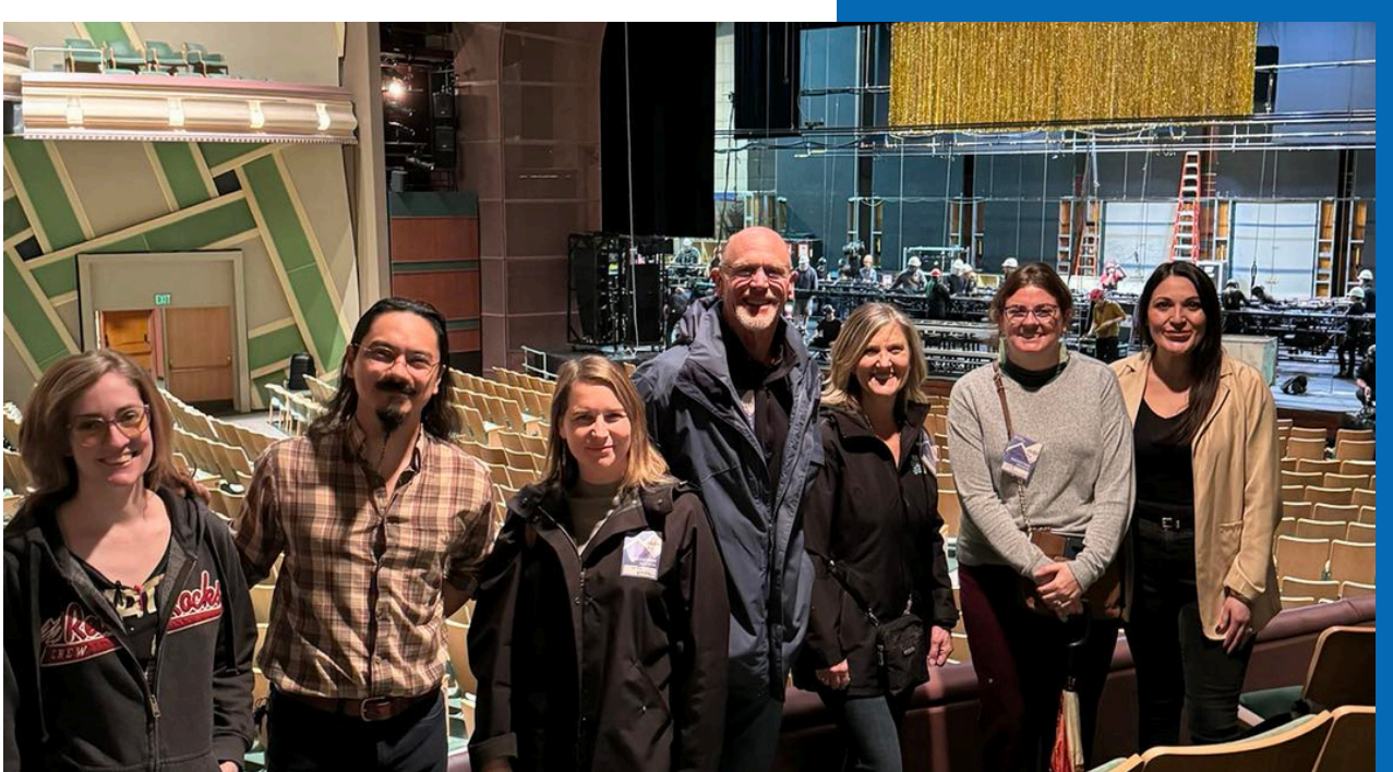
IATSE Local 675 organized a special "pack in" tour of Chicago, February 2024.

The creative sector is comprised of a variety of industries including those related to the production of apparel, art, publishing, and the performing arts. It also includes museums and historical sites. There were 716 establishments with 3,477 employed and over $171 million in total payroll in 2023. Trends show a loss of 550 jobs between 2021 and 2023. Going forward, the creative sector should continue to rebound from the losses incurred in 2020 due to COVID-19 restrictions, especially in the performing arts. Galleries are seeing a similar steady recovery as performing art venues.