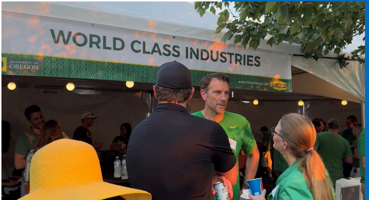
World Class Industries Tailgate Sponsored by Oregon Bio, Technology Association of Oregon and CEDO

Lane County is home to 190 bioscience establishments that employed 1,473 workers with a total payroll of $131 million in 2023. Trends show strong growth in recent years with a slight increase in 2020 during the COVID-19 restrictions. Between 2010 and 2023, the bioscience sector added 132 establishments.